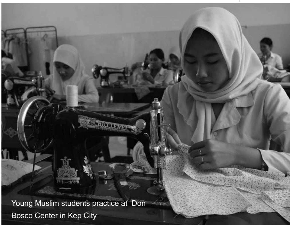
Young Muslim students practice at Don Bosco Center in Kep City